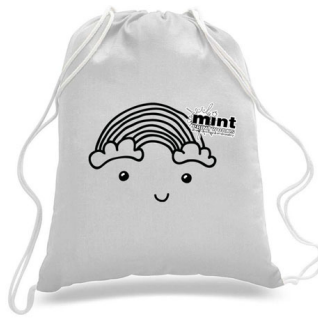
6 oz., 100% cotton canvas bag