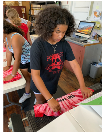
Catching shirts off the dryer.