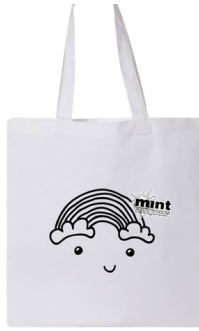
100% cotton tote