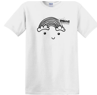
Gildan, 5.3-ounce, 100% cotton