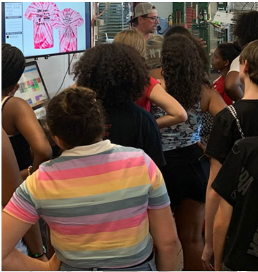
Getting acquainted with the job.