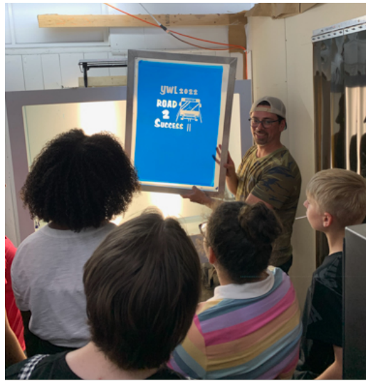
Magic! Creating the screen.