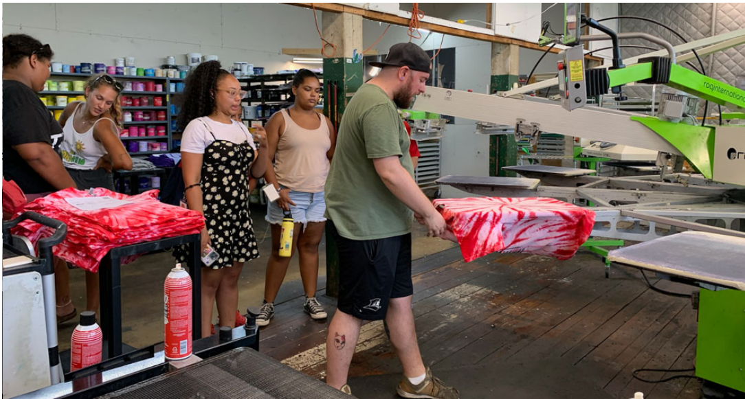
Shirts go on press to be printed.